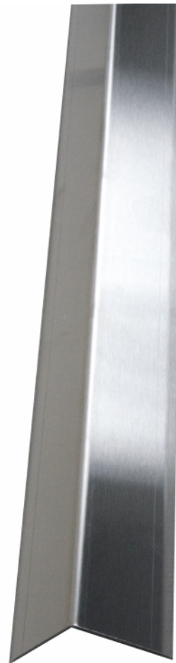
#4 Brush Stainless Steel