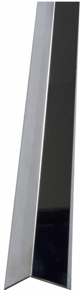
X-L Buff Stainless Steel